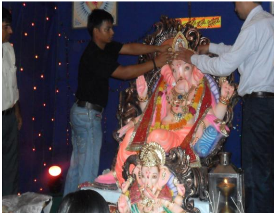
EMPLOYEE PLACING MUKUT