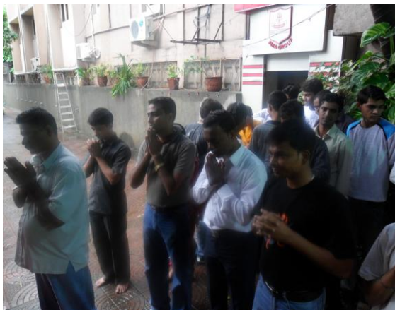
EMPLOYEES WORSHIPING LORD GANESH