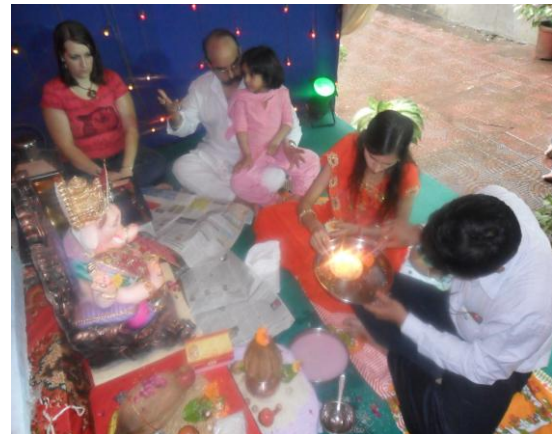
OUR CHAIRMAN AND GUEST DOING