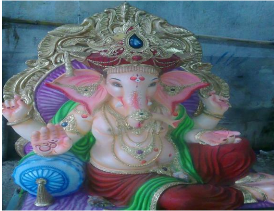
GANESH MURTI AT SISA OFFICE

AUSPICIOUS CELEBRATION OF GANESH FESTIVAL AT SISA CORPORATE OFFICE.