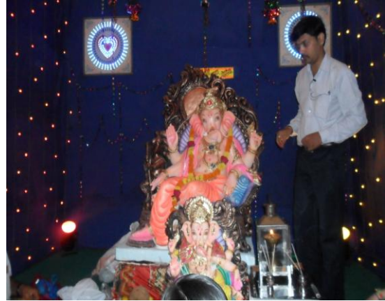
EMPLOYEE DECORATING GANESH MURTI