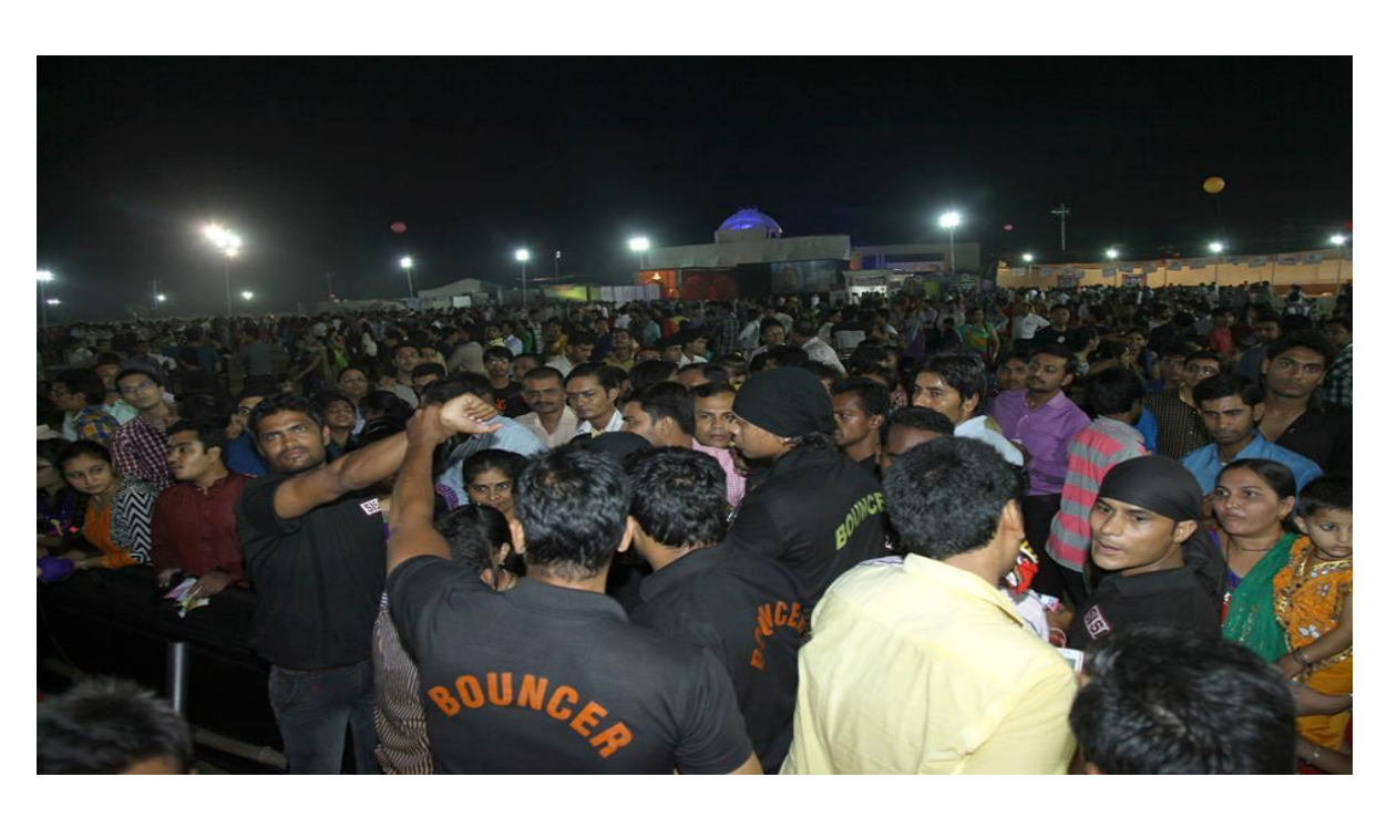
Bouncers are handling the crowd at ground.