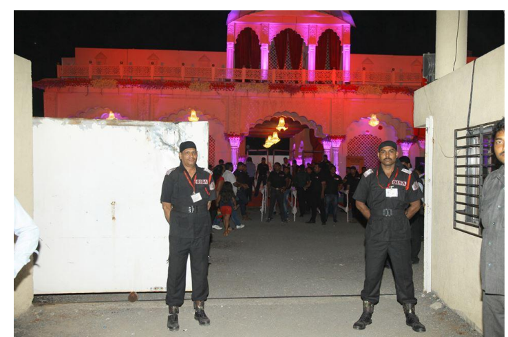
Bouncers at C B Patel gate.