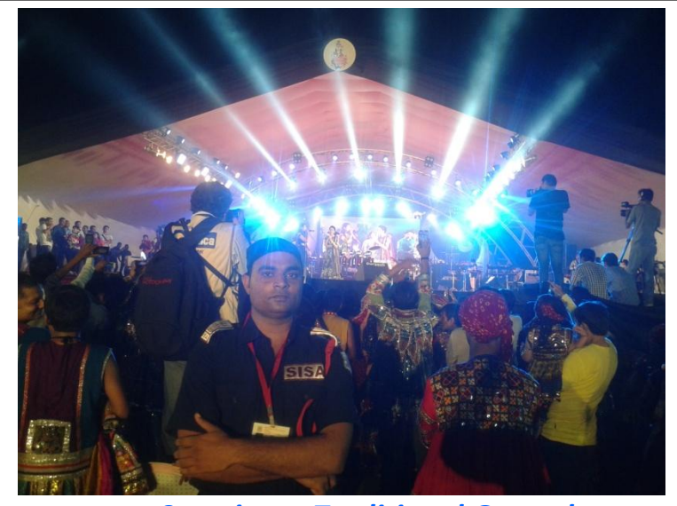
Security at Traditional Ground