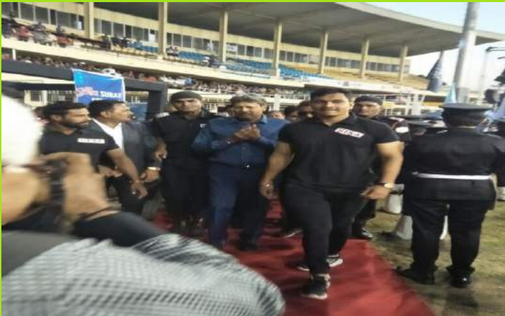
Surat District Cricket Tournament Mr. Kapil Dev visited Cricket Tournament and was escorted by SISA Guards.